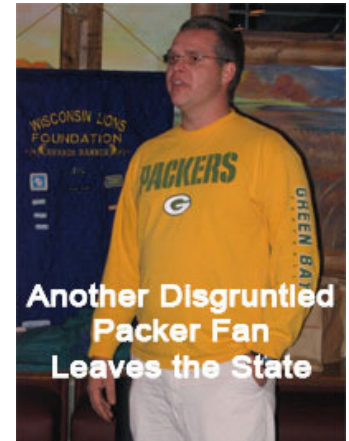
Another Disgruntled Packer Fan Leaves the State