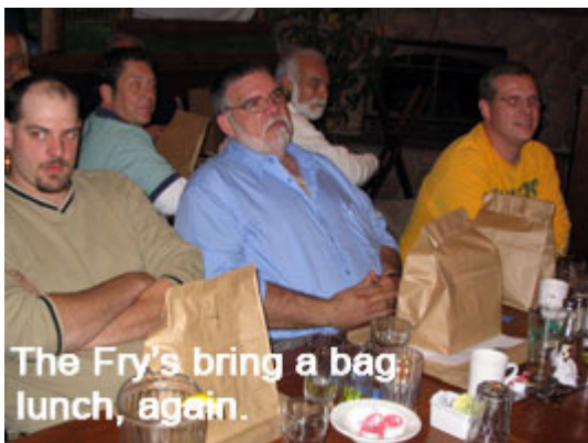
The Fry's bring a bag lunch, again.