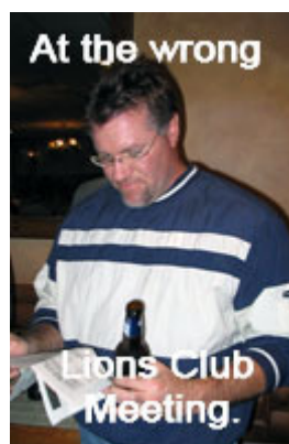
At the wrong