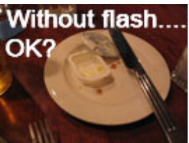
Without flash.... OK?