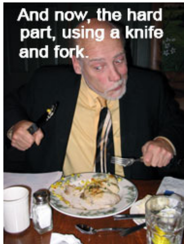
And now, the hard part, using a knife and fork.