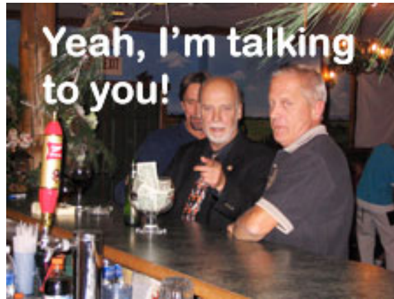
Yeah, I'm talking to you!