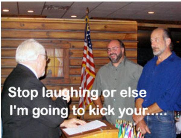
Stop laughing or else I'm going to kick your.....