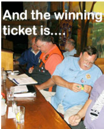
And the winning ticket is....