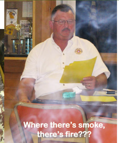
Where there's smoke, there's fire???