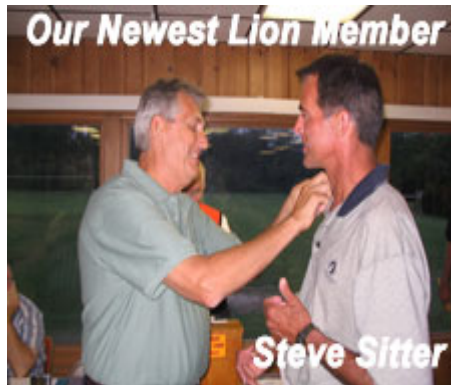
Our Newest Lion Member