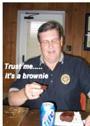
Trust me..... it's a brownie